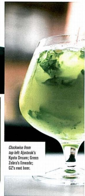
Clockwise from top left: Ajasteak's Kyoto Dream; Green Zebra's limeade; GZ's root beer.